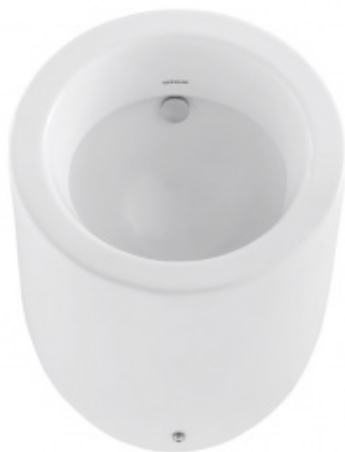
SLP 82 - WCA - Sanindusa